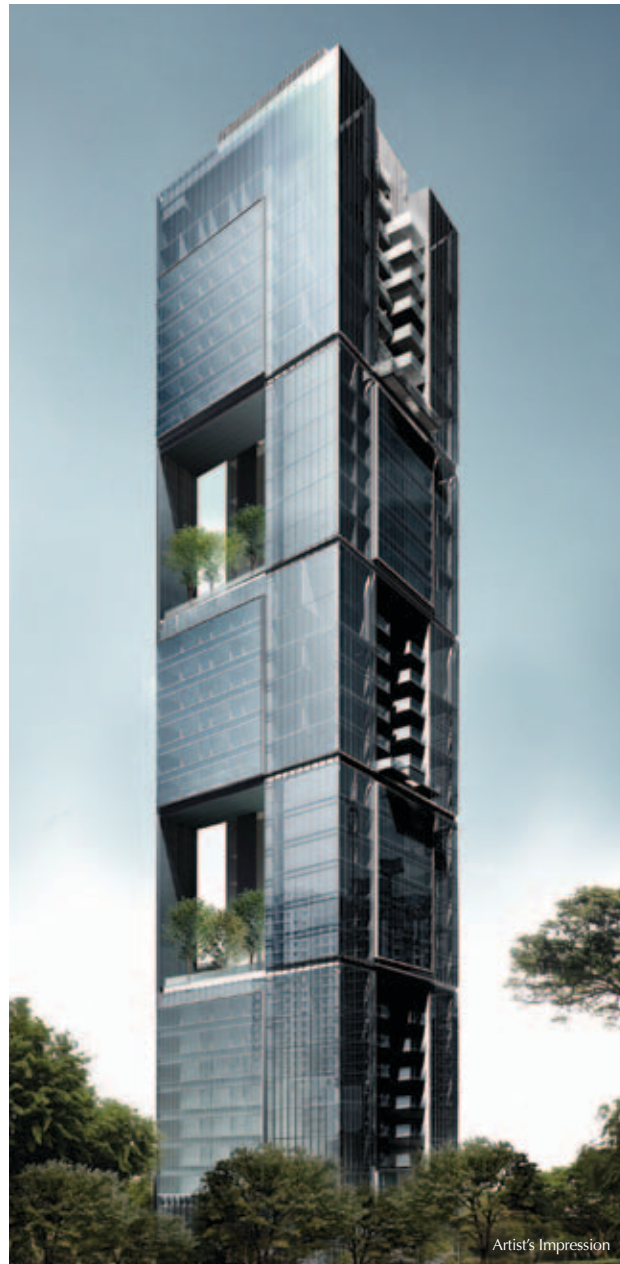
TwentyOne Angullia Park, Singapore