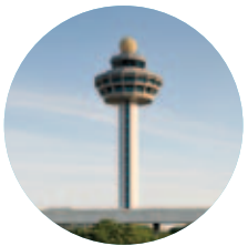
15 min drive to Changi Airport