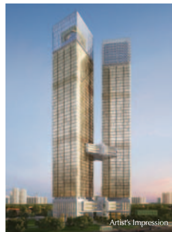
Indonesia 1, Jakarta