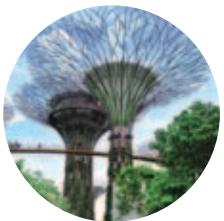
8 min drive to Gardens by the Bay