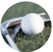
8 min drive to Marina Bay Golf Course