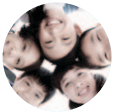
8 min drive to Prestigious Schools