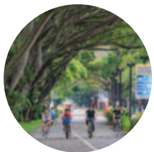
5 min drive to East Coast Park

Be spoilt for choice, with a sea of amenities near home. Relax at East Coast Park or rejuvenate at Gardens by the Bay. Enjoy retail therapy at shopping malls or tee off to a day of fun at Marina Bay Golf Course. Be surrounded by a plethora of prestigious schools, from local to international. Enjoy an endless flow of convenience, here at home.