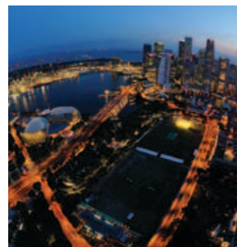
Formula One race circuit around Marina Bay area in Singapore

OKP Land Pte Ltd is a wholly-owned subsidiary of OKP Holdings Limited (OKP). OKP is a leading homegrown infrastructure and civil engineering company in the region. It specialises in the construction of urban and arterial roads, expressways, vehicular bridges, flyovers, airport infrastructure and oil & gas-related infrastructure for petrochemical plants and oil storage terminals as well as the maintenance of roads and road-related facilities and building construction-related works. It has expanded its core business to include property development and investment. It tenders for both public and private civil engineering, and infrastructure construction projects. It has been listed on the Singapore Exchange since 26 July 2002.