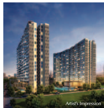
Executive condominium project at Yuan Ching / Tao Ching Road in Singapore

Developer: CS Amber Development Pte Ltd (200916566C) • Developer License No: C1086 • Location: LOT 3078K MK25 AT 8 Amber Road • Tenure of Land: Estate in Fee Simple • Expected Date of Vacant Possession: 30 June 2017 • Expected Date of Legal Completion: 30 June 2020