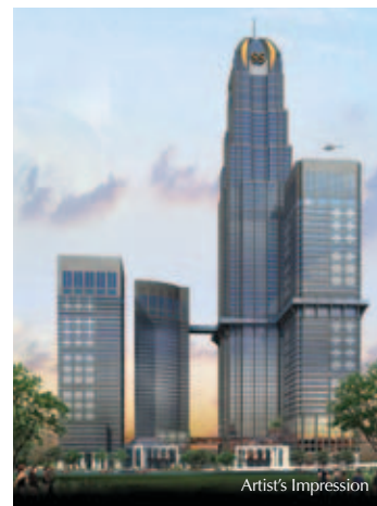
Sampoerna Strategic Square, Jakarta

Not resting on its laurels, CS Land will continue to challenge preconceived notions of luxury living and property development, bringing the world more surprises and breaths of fresh air.